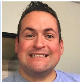
Marc Velasco Communications